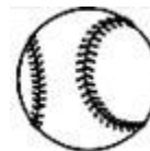
Baseball / Softball